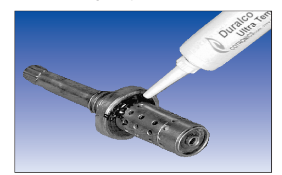
4703 Repairs a Valve Seal